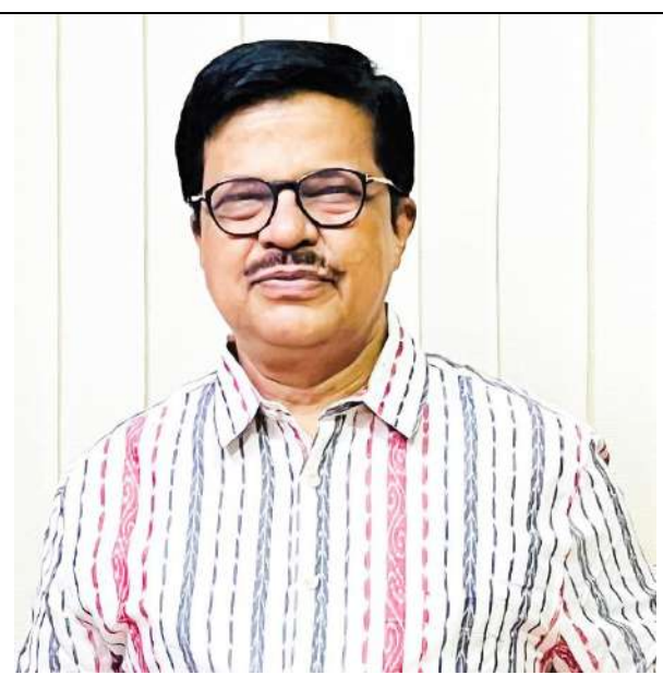
Cotton shirts with tie & dye design