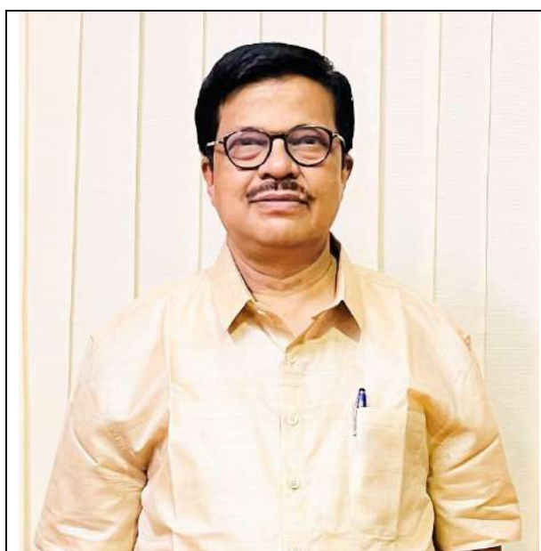
Tassar (silk) fabrics

With a view to generate awareness about the changing taste of the handloom consumers, particularly the younger generations, members of the society made continuous efforts. Few samples Gent ware were stitched out of available fabrics, which were displayed on the social media. It got enthusiastic response.