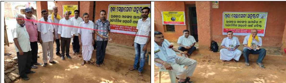
Branch Office of SHRADDHA opened in Surendrapatna, Nuapatna on 21.05.22