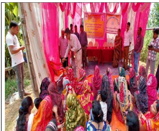
Inauguration of the program