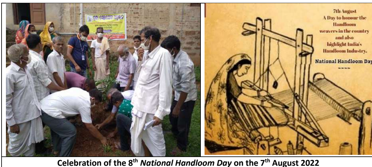
Celebration of the 8 th National Handloom Day on the 7 th August 2022