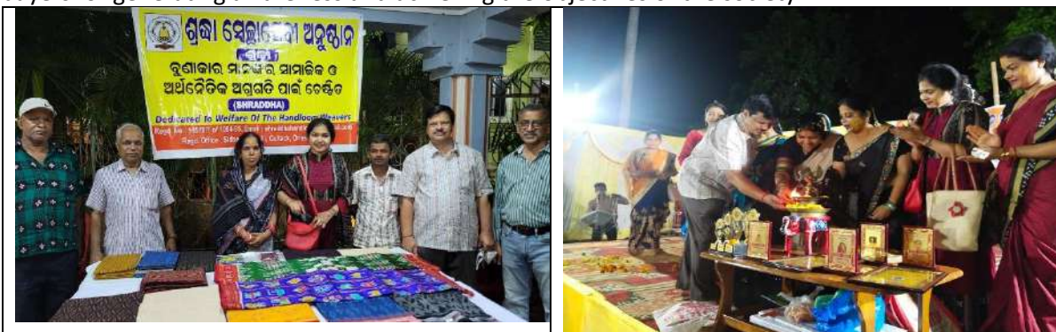
Participation of SHRADDHA in the Mahila Chandan Mahotsav mela at Siddhi mandap, Old town, Bhubaneswar on 24 th May 2022