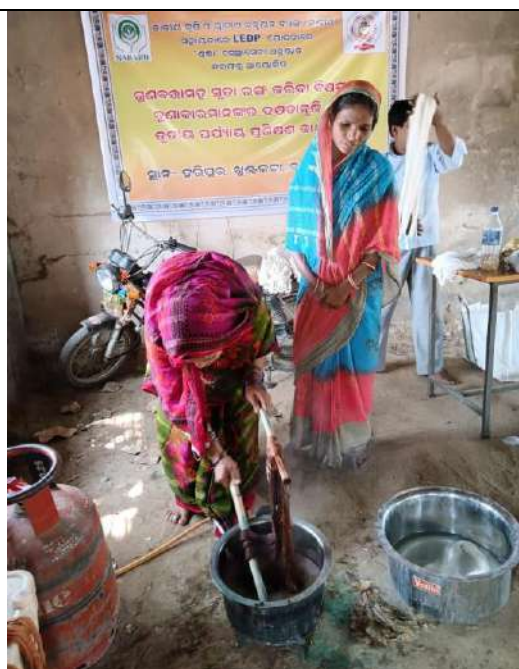
Hands on training