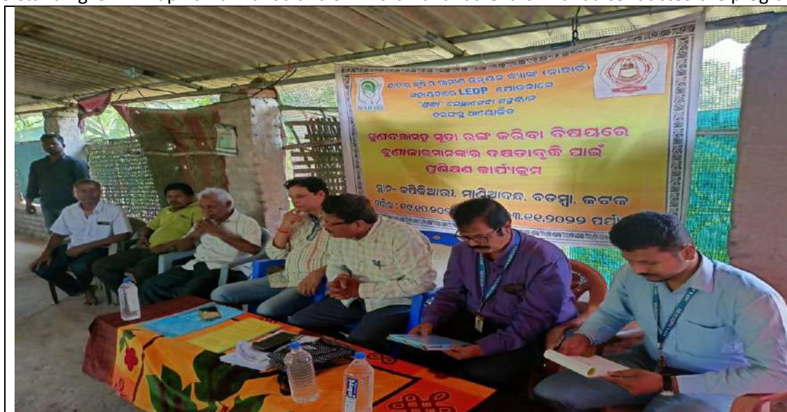
Training on imparting soft skill