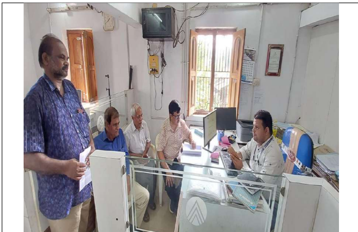
President and members of SHRADDHA in discussion with the Branch Manager Odisha Gramya Bank, Maniabandh on 18 th Sept 2023

It is expected that bankers will come forward to sanction loans to the remaining trainees and more importantly the loan sanctioned will be rotated and ensure provision of working capital and increase in earnings of the weavers on a continuous basis.