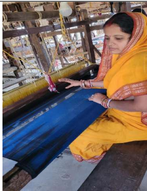
Sarees Kargil design being woven earlier, Product diversification for weaving saree with new color and design