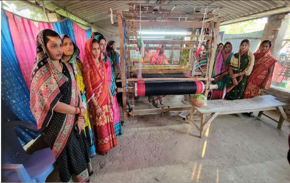
Production Centre at Kasikiari 3rd Feb 2024