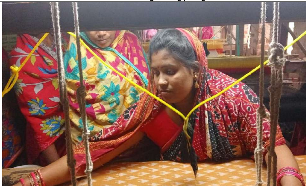
Women weaver on loom for production of running yardage as dress material