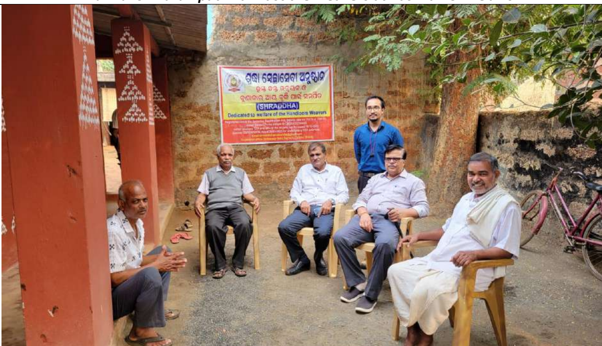
Review of project activities at the branch office on 3 rd Feb 2024