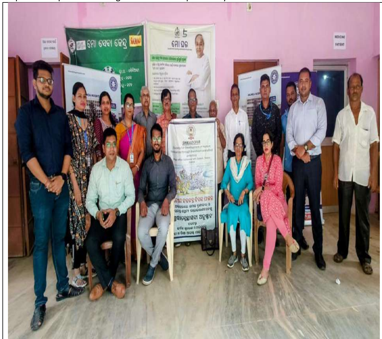
Health camp held in the Kasikiari gram panchayat office

The event generated lots of enthusiasm among the local villagers and goodwill for the corporate hospital in discharge of its social responsibility.