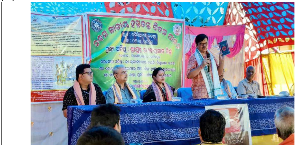
Branch manager, Maniabandh in the meeting with the weavers on the National Handloom Day celebration at Kasikari on the 7 th August 2023

As a result, out of the 90 women trainees covered under the training program under LEDP, loan amounting to Rs11.69 lakhs was sanctioned to 41 trainees since starting of the LEDP. This is in addition to loan amounting to Rs4,45,000/- sanctioned to 21 no of trainees before starting the project.