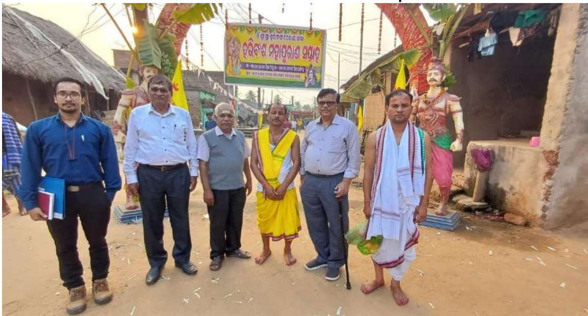
“Harivansh Puran path” amidst the weavers at Kasikiari 3 rd Feb 2024