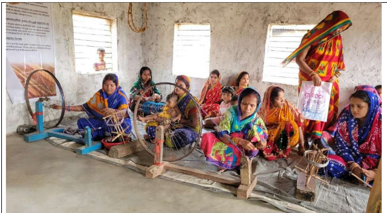
Product diversification weaving under progress