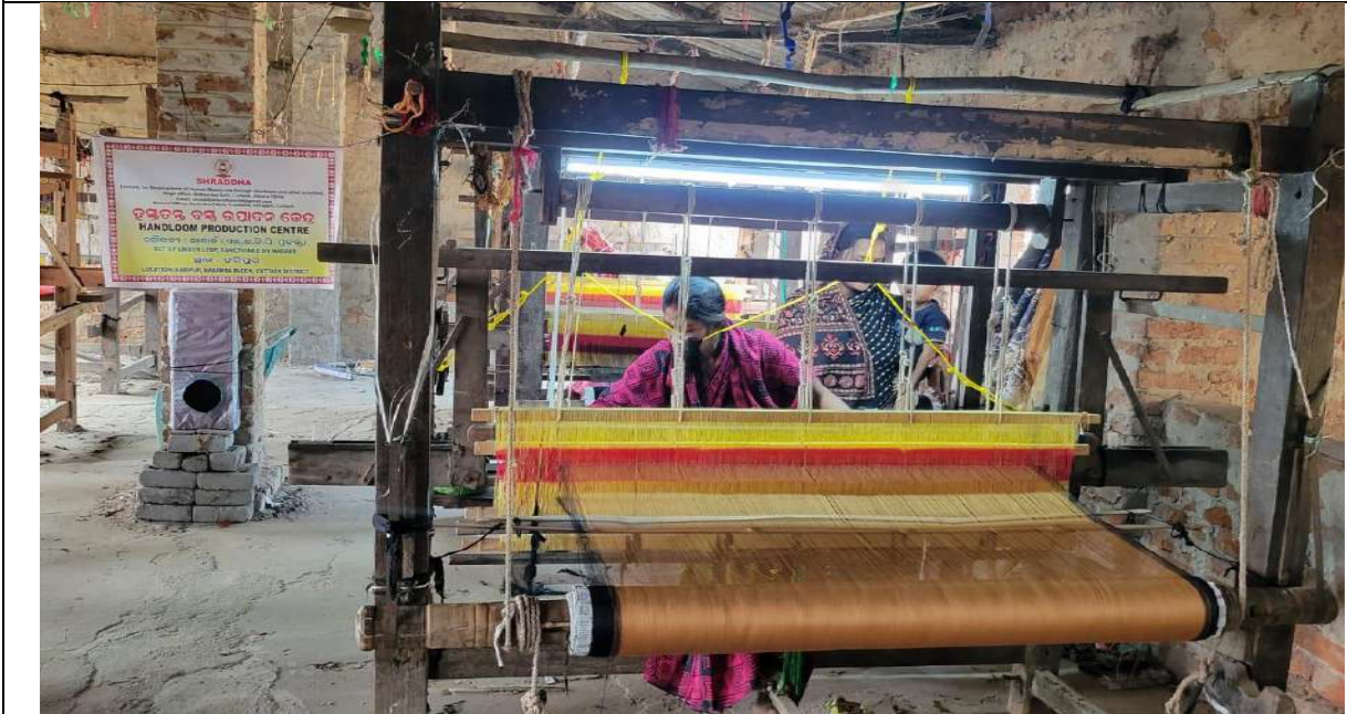
Weaving with quality and new design