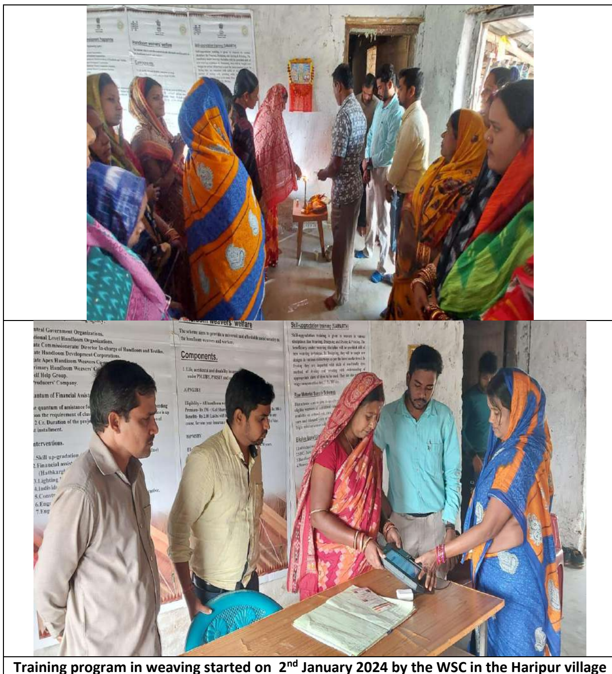
Training program in weaving started on 2 nd January 2024 by the WSC in the Haripur village