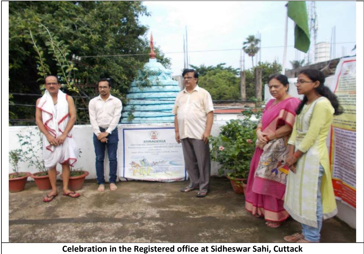
Celebration in the Registered office at Sidheswar Sahi, Cuttack