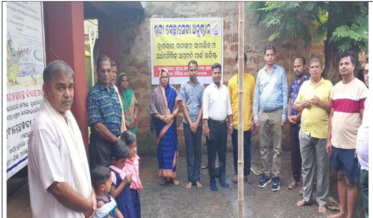
Celebration in the Branch office at Surendra Patna, Nuapatna

The 77 th Independence Day was celebrated on the 15 th August 2023 with hoisting of national flag and singing of National Anthem in the registered office as well as the Branch office with active participation of the weavers, members, and other stakeholders of the society.