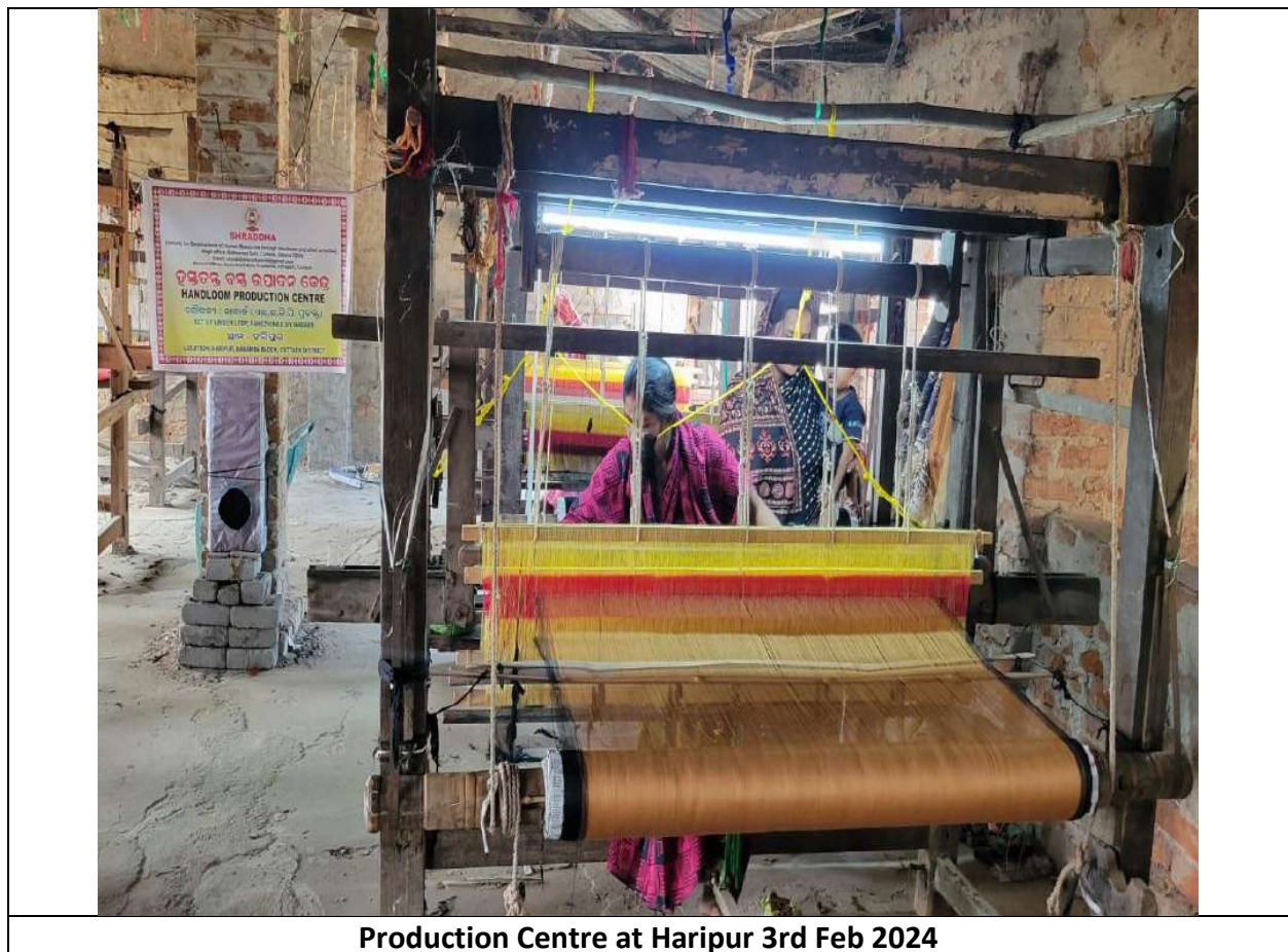
Production Centre at Haripur 3rd Feb 2024

Pictures of the fabrics made by the weavers before and after the training, as shown herein, clearly indicate the improvement in quality of the product as well as product diversification, which was appreciated by the consumers.