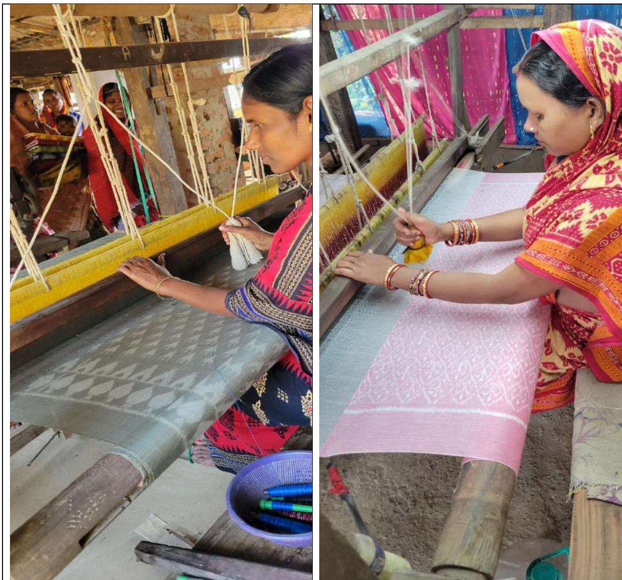
Saree and dress material with new design and in soft colour woven by the weavers, which has led to increase in their earnings