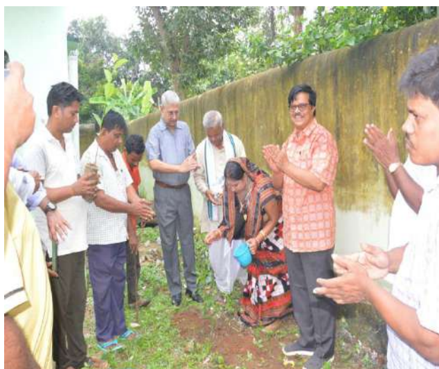
Tree plantation by Chairperson, Kasikiari gram panchanyat and President, Shraddha

The national handloom day celebration started with plantation of flower and fruit bearing trees in the premises of the gram panchayat office as a humble effort to check global warming and for environmental conservation.