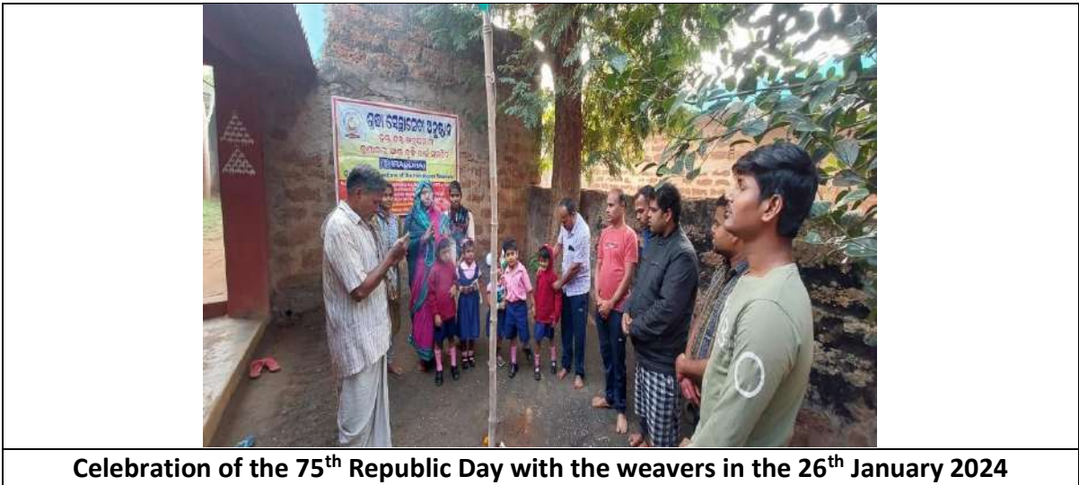
Celebration of the 75 th Republic Day with the weavers in the 26 th January 2024

The 75 th Republic Day was celebrated on the 26 th January 2024 with unfurling of the National Tricolour and singing of National Anthem in the registered office as well as the Branch office with active participation of the weavers, members, and other stakeholders of the society.