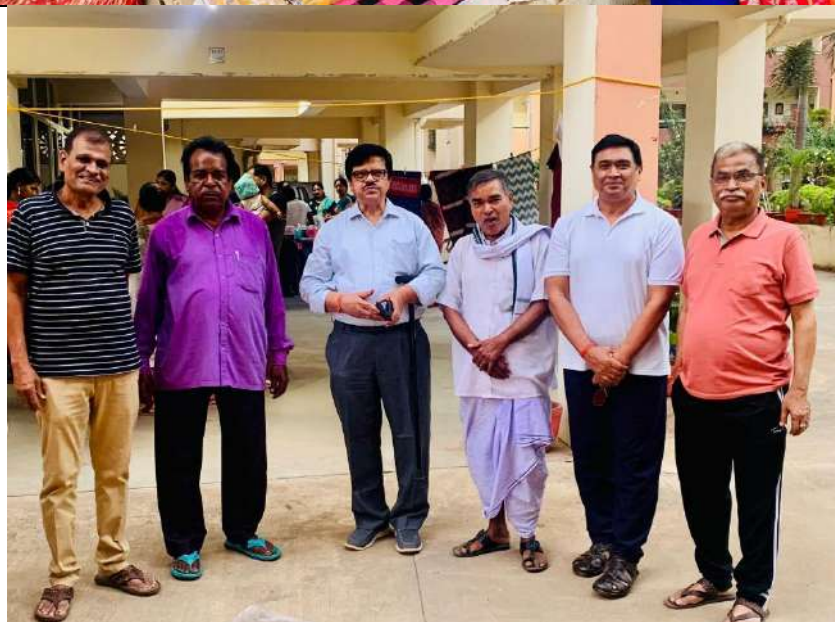
Show cum Sale exhibition in the Kendriya Vihar Ph II, Bhubaneswar on the 18-02-2024