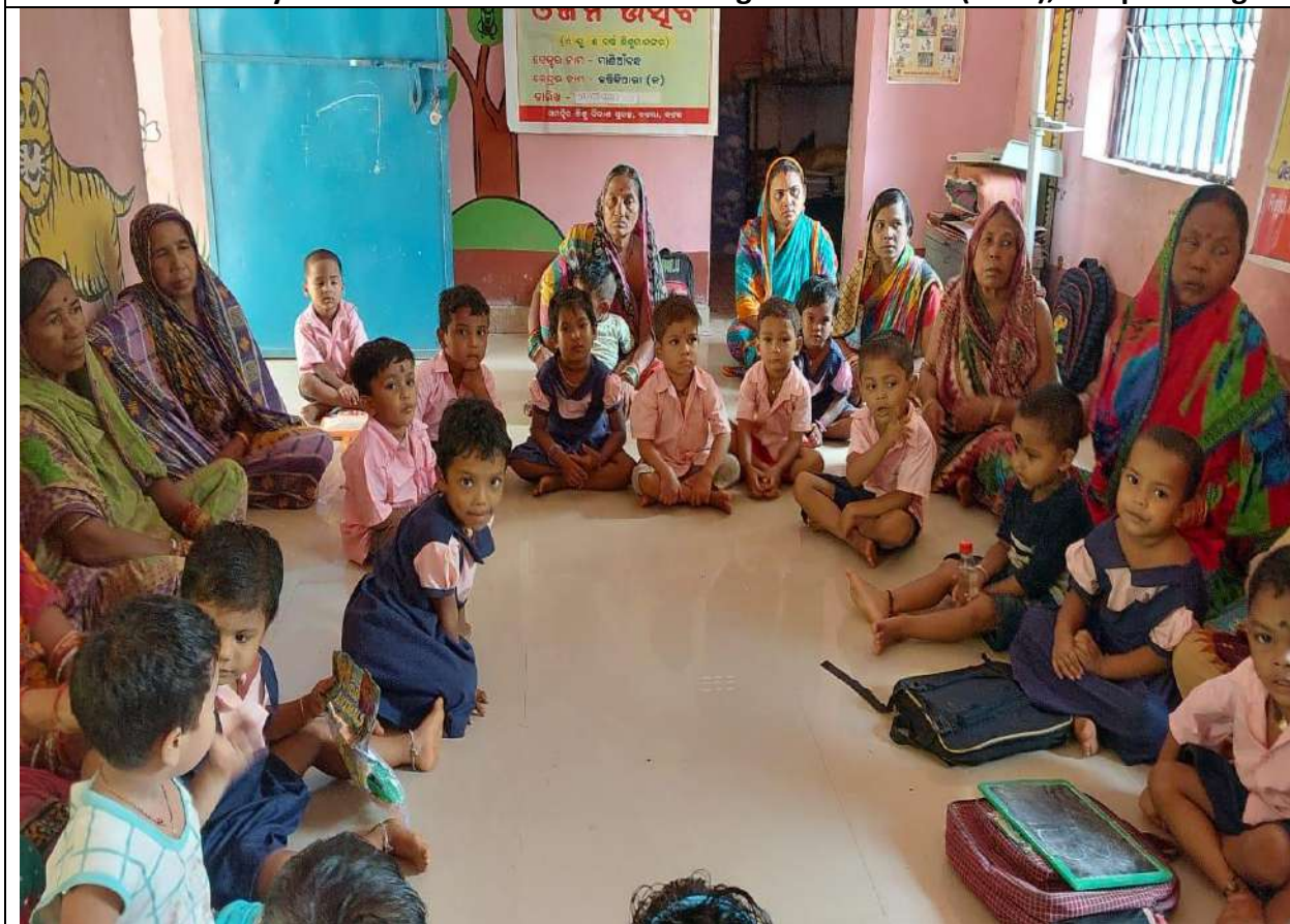
Distribution of slate & illustrated books to children in the Anganwadi Center (AWC), Kasikiari village