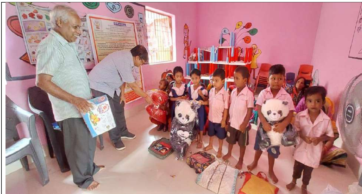
Distribution of toys and books to children in the Anganwadi Center (AWC), Haripur village