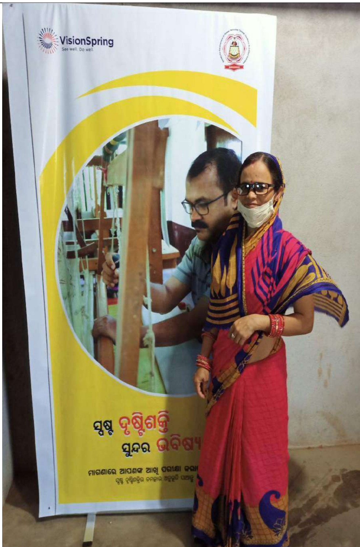
The weaver with the spectacles after the eye test at the camp site