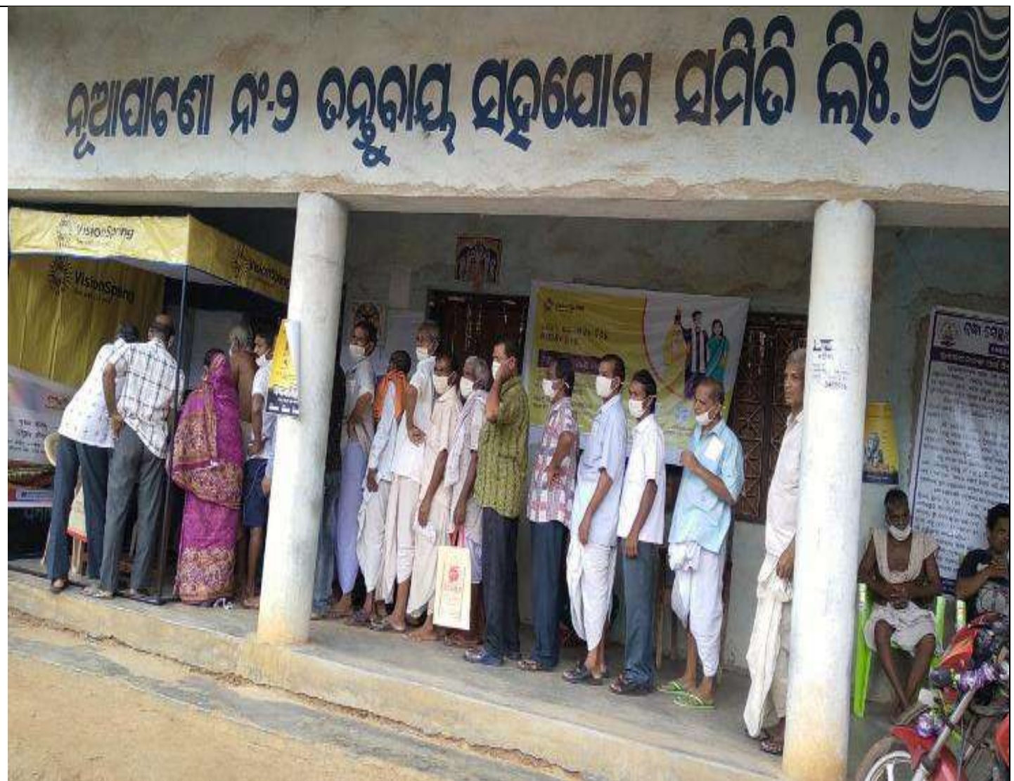
Weavers waiting for registration for eye testing at the camp site (observing covid protocol)

As per program, registration and eye testing of weavers was started on the forenoon of 7 th August 2022, the National Handloom Day in premises of the Nuapatana no 2 Weaver Coop Society in an orderly manner. Visionspring foundation deployed technical team with equipment, who undertook the eye examination and provided eyeglasses on payment of a nominal amount of Rs 80 only per eyeglasses. The weavers expressed satisfaction and gratitude by getting the eyeglasses at a. The team assured that those needing special eyeglasses, which were not readily available with the team, would be provided eyeglasses within a period of one month. On the first day, eye screenings of 98 weavers were done, out of which 84 weavers were provided eyeglasses. The program will continue for about ten days for covering up to 1,000 weavers as per target.