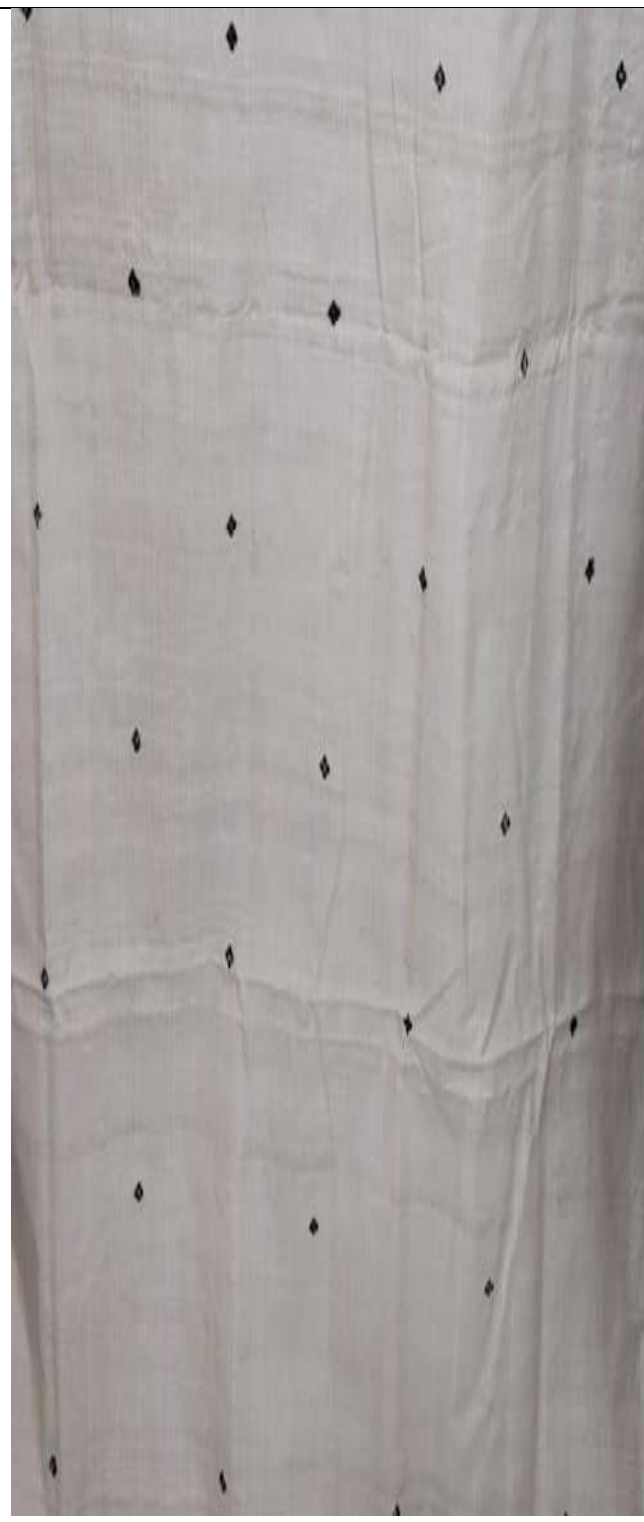
Dess material woven with pastel / lighter shades after the training