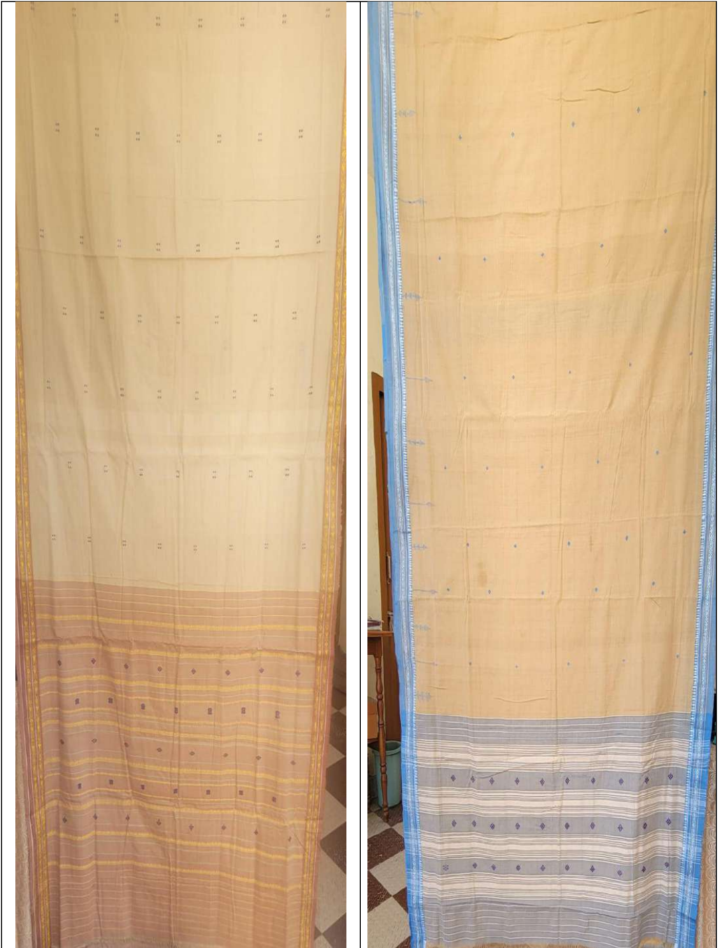
Saree woven with lighter shades after the training